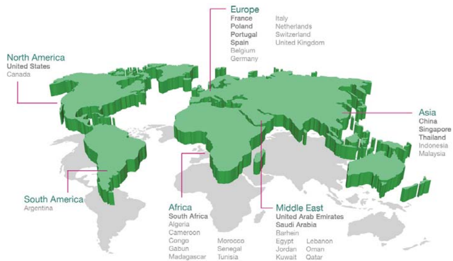
Sage Offices supporting Sage ERP X3 Sage ERP X3 resellers

To best serve mid-sized multi-country customers, our teams are not over-sized, nor under-sized but "human-sized": whether your project is centralized or locally-driven, you will find a Sage team able to support all of your branches locally as well as to provide you global assistance and reporting.